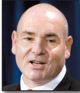
GEORGE SMITHERMAN Wins with Giambrone loss

OVERALL: The sands of Furious George's policies are hard to corral. He'll try to reduce or eliminate the vehicle registration fee. He'll look at road tolls. Squirm. Wiggle. ON THE BUDGET: He'll sacrifice hobby horses. He'll do a line-by-line review of expenses. Never heard that before. GIAMBONER: He gets biggest rise out of the fall of a contender on the left. FACEBOOK GROUPIES: 1,570